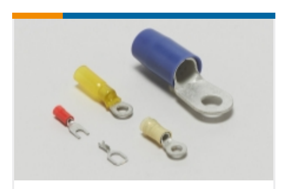
Ring Terminals & Spade Terminals(537)