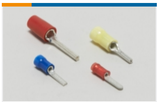
Crimp Wire Pins, Tabs & Ferrules(25)